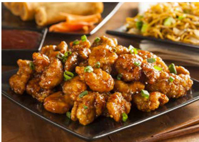
Far East Feast