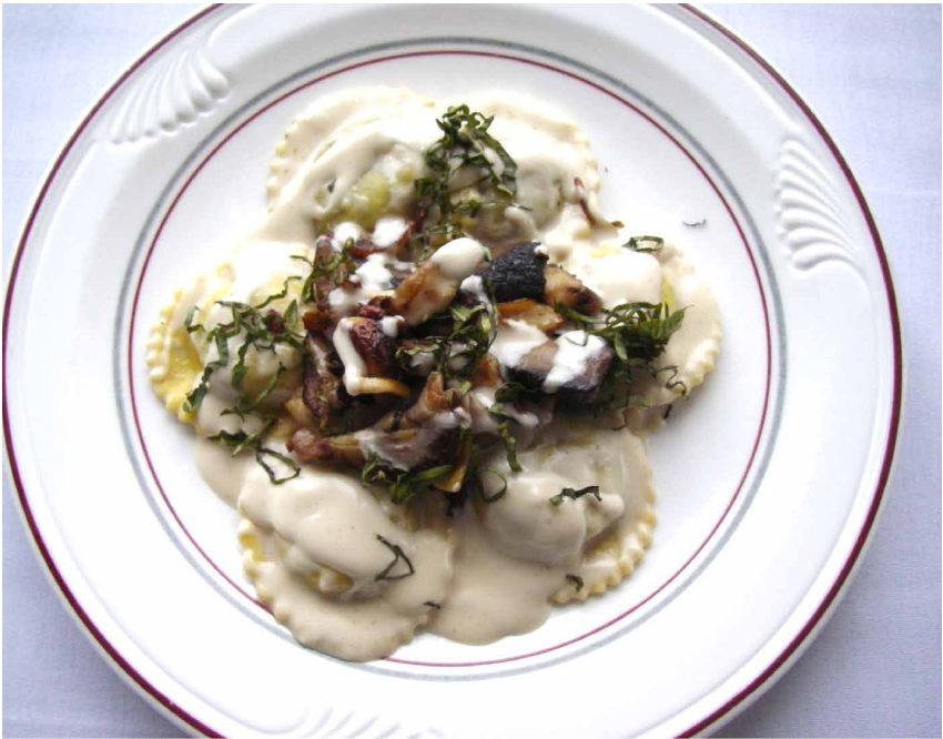
Wild Mushroom Ravioli