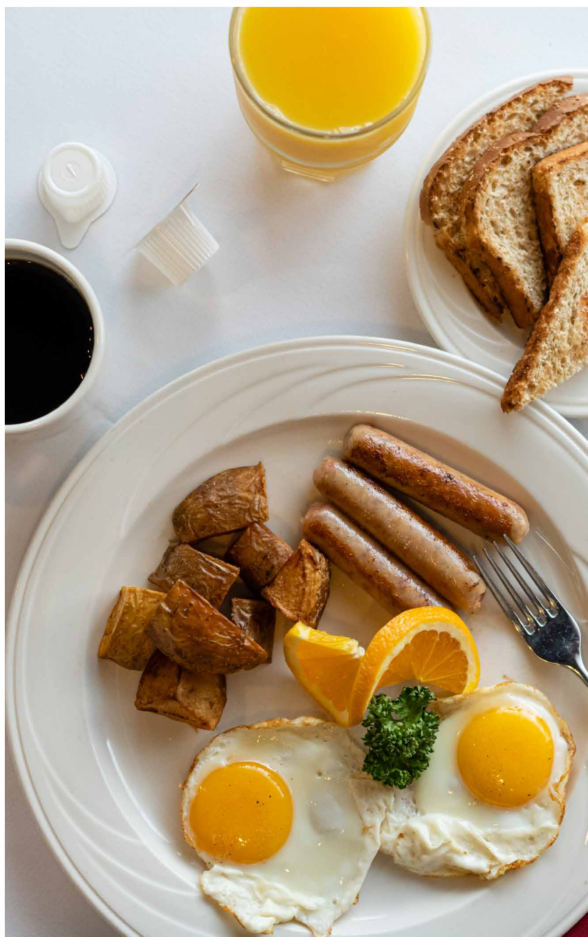
Classic All American