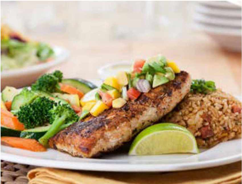
Baked Mahi Mahi