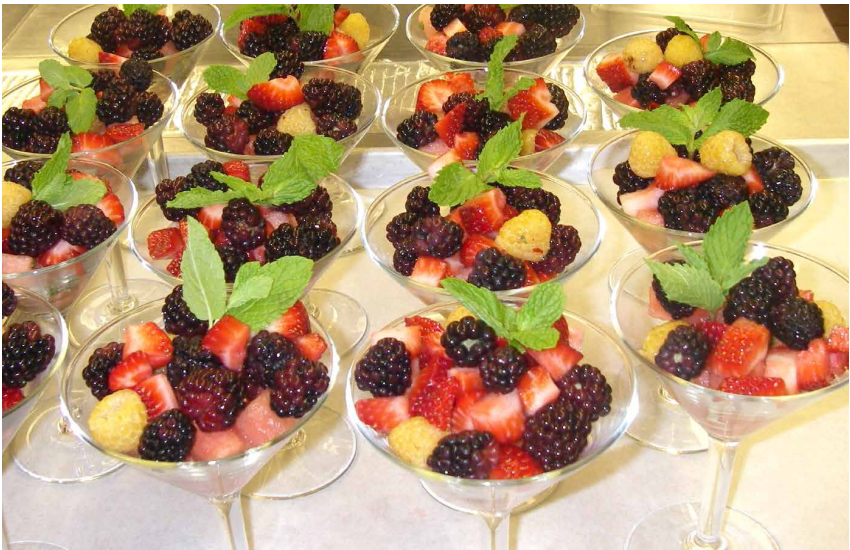
Seasonal Marinated Fruit