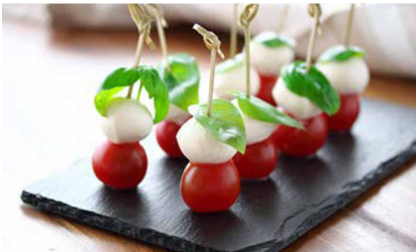
Mini Caprese Skewers