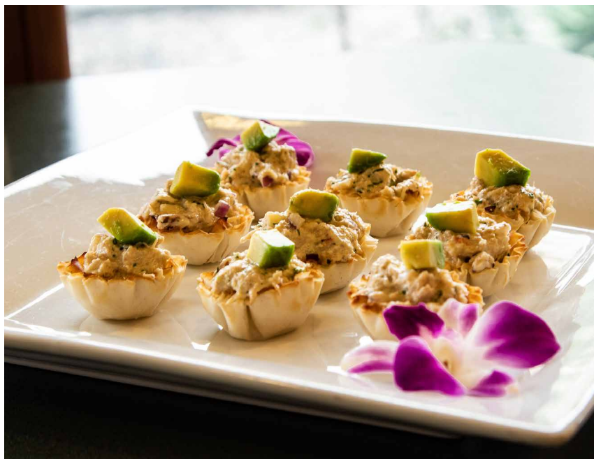
Crab and Avocado Bites